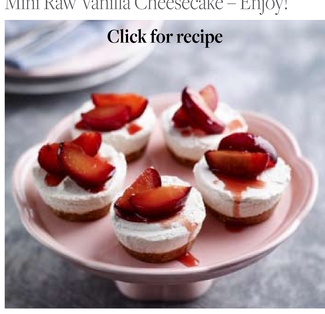
Click for recipe